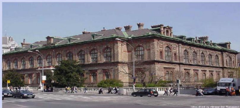
Institut für Medizinische Chemie Zentrum für Physiologie und Pathophysiologie

Institute of Medical Genetics and Institute of Medical Chemistry